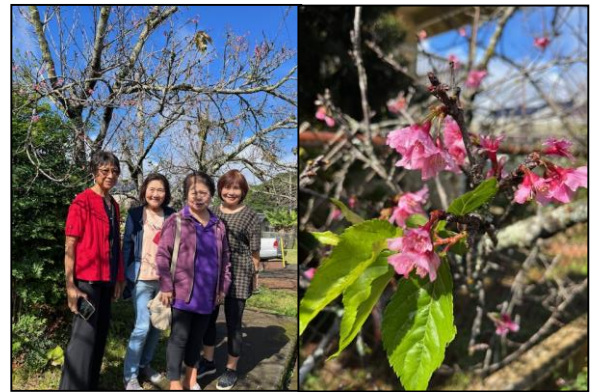
Members enjoy a little Sakura Tour in Wahiawa.