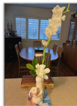
Nature's beauty, like love, is so precious. These flowers are from my dad's garden. Happy Valentine's Day!