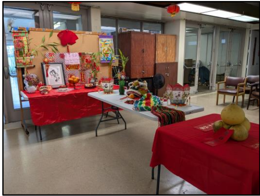
Lunar New Year décor displayed in our Activity Room.