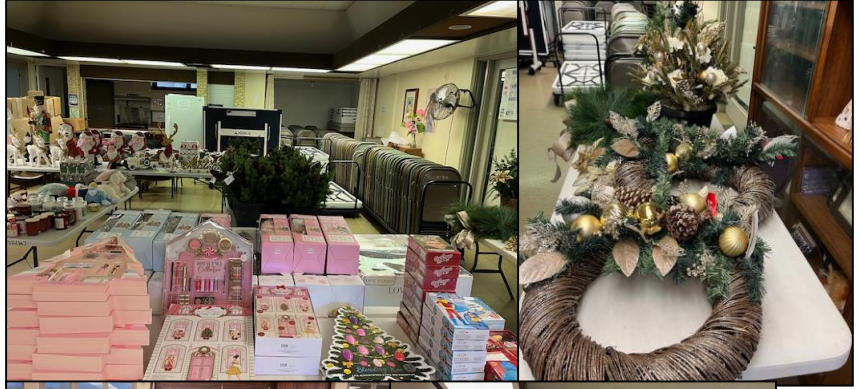
After holiday sale at LMPSC. Thanks to TJ Maxx!