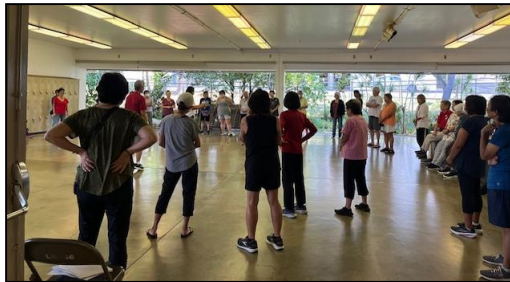
Self Defense Workshop on 1/25/25.