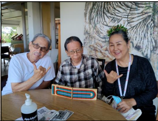
"Happy Thanksgiving!" from Cribbage class.