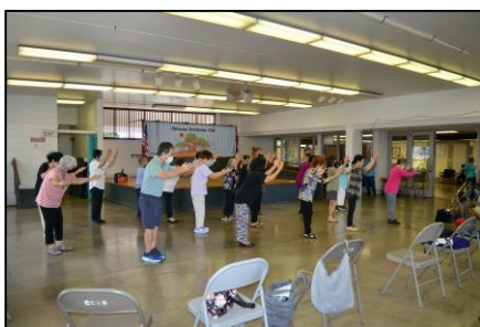
ONC members dance and bowing to the song "Shimanju nu Takara"