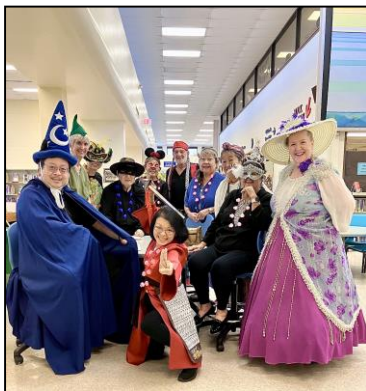
"The Sing For Your Life class wishes you and yours a happy, healthy, heart-warming Holiday Season!"