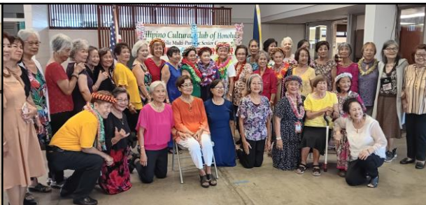
Celebrated the birthdays of August and September born members of Filipino Club.