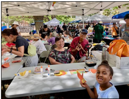
LMPSC's booth at Children and Youth Day.