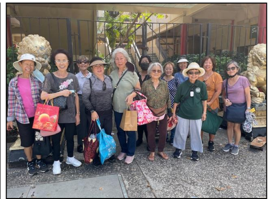
Chinatown Tour – photo submitted by Lynne Howell.